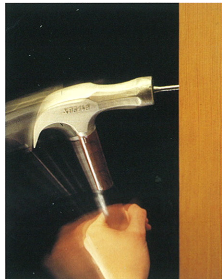
IMPACT RESISTANT RESIN

A formidable team of engineers Formation can provide the solution to this dilemma through their comprehensive range of Rapid Prototyping (RP) skills. Formation has built a formidable team of engineers